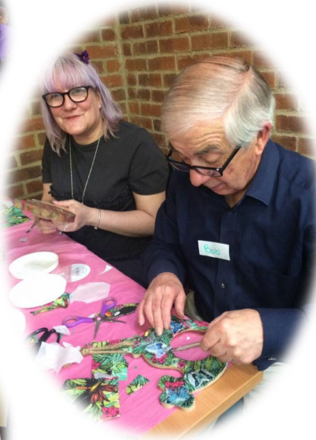
Making & selling crafts