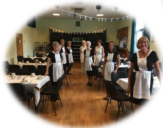
Afternoon tea party